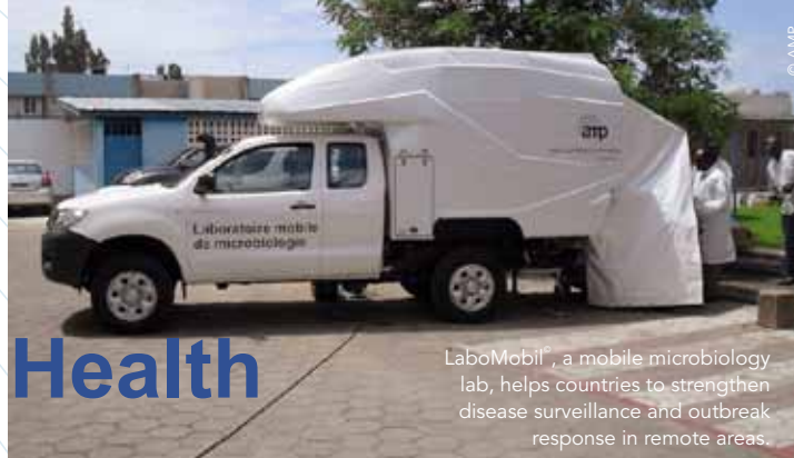
LaboMobil, a mobile microbiology lab, helps countries to strengthen disease surveillance and outbreak response in remote areas.